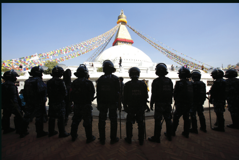
Nepalese police stand guard at the premises of the Boudhanath Stupa after a Tibetan monk self-immolated in Kathmandu on February 13, 2013.

Human Rights Watch urged Nepal to take specific measures to better guarantee the basic rights of Tibetans in the country. China should lift restrictions on and end abuses against Tibetans. It should stop pressuring Nepal to take measures inconsistent with Nepal's international human rights and refugee law obligations.