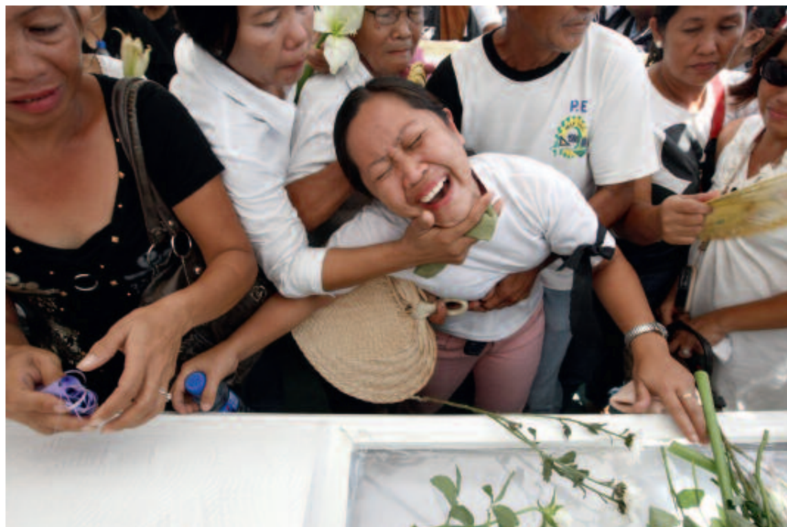
Broken lives: Family members grieve during a funeral ceremony at General Santos City cemetery.

On December 8 the mission members including NUJP leaders gathered to draft a preliminary mission report and recommendations.