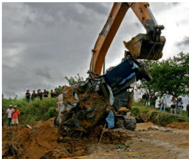
A terrible site: The killers had not finished burying the evidence of their atrocity.

Five vehicles are also found in the area, as follows: four Toyota Grandia with plate numbers MVM 789, MVM 884, MVM 885 and LGH 247, one Pajero with plate number MCB 335 and one backhoe. Other items seen at the site include various personal items, assorted empty shells and other documents. Troops immediately secure the area prior to the arrival of the PNP SOCO Team for investigation.