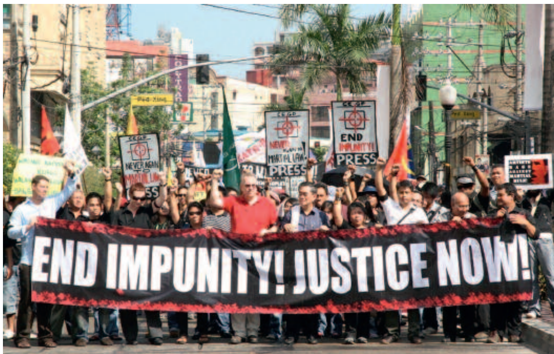
Collective outrage: Mission members lead a protest through the streets of Manila, December 9.