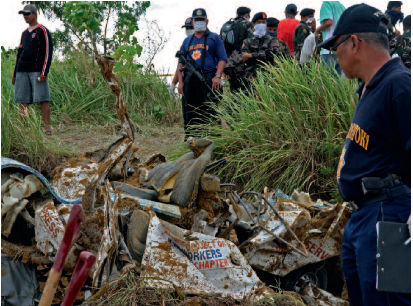
Forensic nightmare: There are concerns that the crime scene was compromised and vital evidence may not have been collected.

a body remains missing, and there are fears there may be more graves to be found.