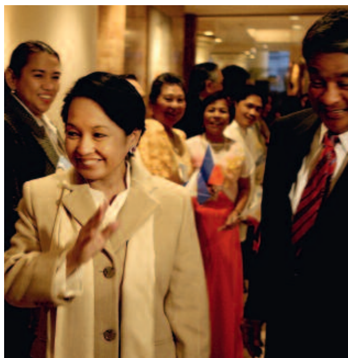
Gloria Macapagal-Arroyo: More than 100 journalists have been killed during her administration.

The Ampatuan Town massacre was perpetrated on November 23, 2009 against at least 57 unarmed civilians, 31 of them