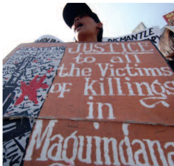
Raised voices: Protesters at the Philippine National Police headquarters in Quezon City.

“There is no pressure, just the possibility of pressure, which I guess in itself is pressure,” he said. “This is what happens when governments act outside the law, when people think they are above the law and there is the belief that misdeeds are unpunishable.” The Philippines Supreme Court agreed to move the murder hearings to Manila in response to the threats and expectation of threats, yet the Government has resisted calls to establish a special tribunal to investigate the massacre, despite the scale of the undertaking.