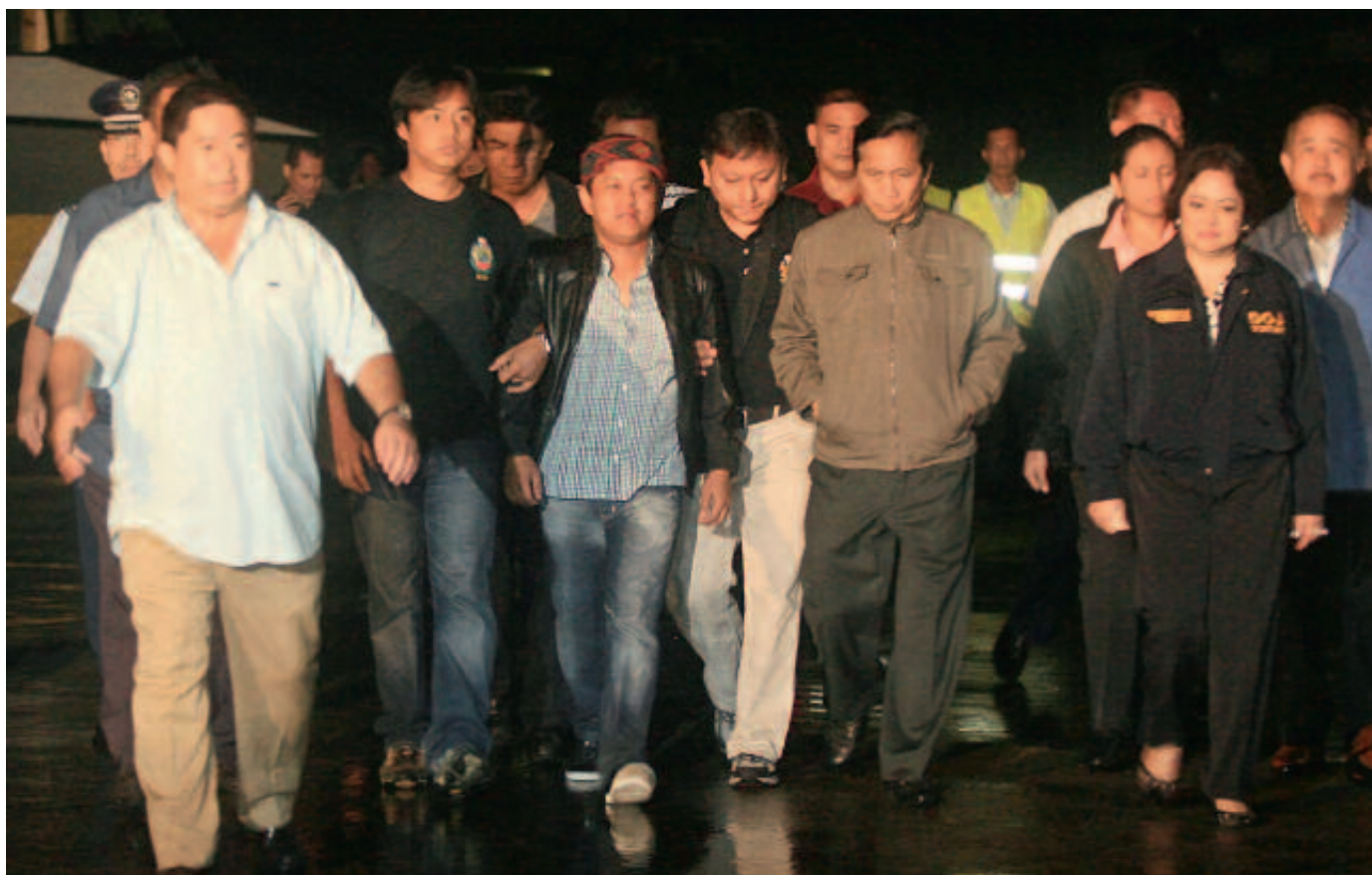
Under arrest: Andal Ampatuan Jr is led into court in General Santos City by agents of the National Bureau of Investigation.