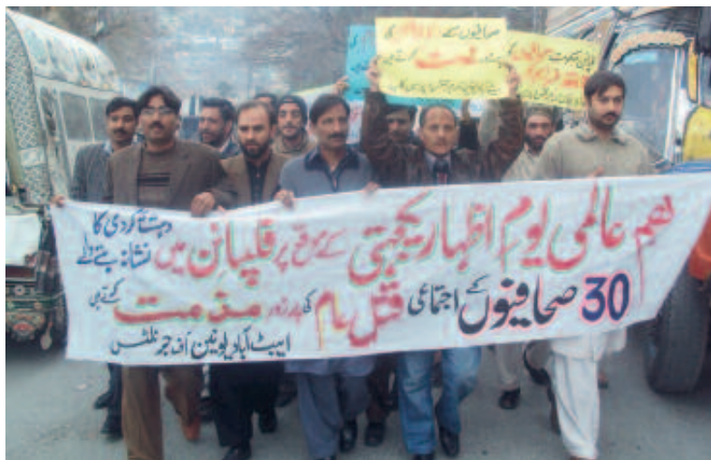
Opposite page: Global outrage: IFJ staff in Brussels protest at the November 23 massacre.