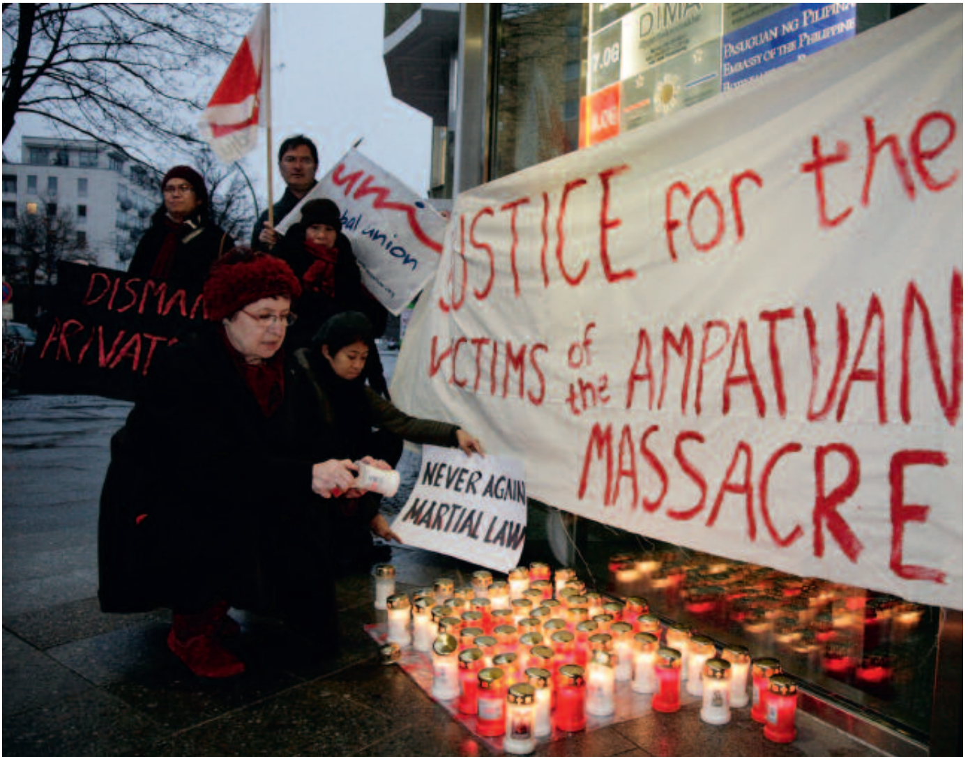
We will never forget: Protesters light candles for the victims at a vigil in Berlin.

developed by the NUJP and the families to formalise an organised structure for future action.