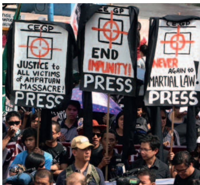
Solidarity: Journalists march in Manila to protest the culture of impunity in the Philippines.