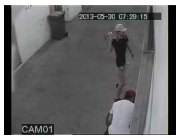
Two young assailants destroyed the front door of the Epoch Times office in Tsuen Wan.

The owners of Hong Kong media groups and the premises of media outlets suffered attacks. The Epoch Times told the IFJ that two men destroyed the glass frame door of the office in Tsuen Wan in the early hours of May 31. Before the incident, people distributing the paper in Central and Wan Chai districts were threatened by unknown assailants. An employee of the newspaper said: "In early May, some of our advertising clients complained to us that they received some threatening messages which asked them to stop advertising in our newspaper. We have been harassed by unknown people from time to time. Sometimes we found the lock was damaged without knowing the reason. The other time our newspapers were stolen when we placed it on the street." A complaint was lodged with Hong Kong police.