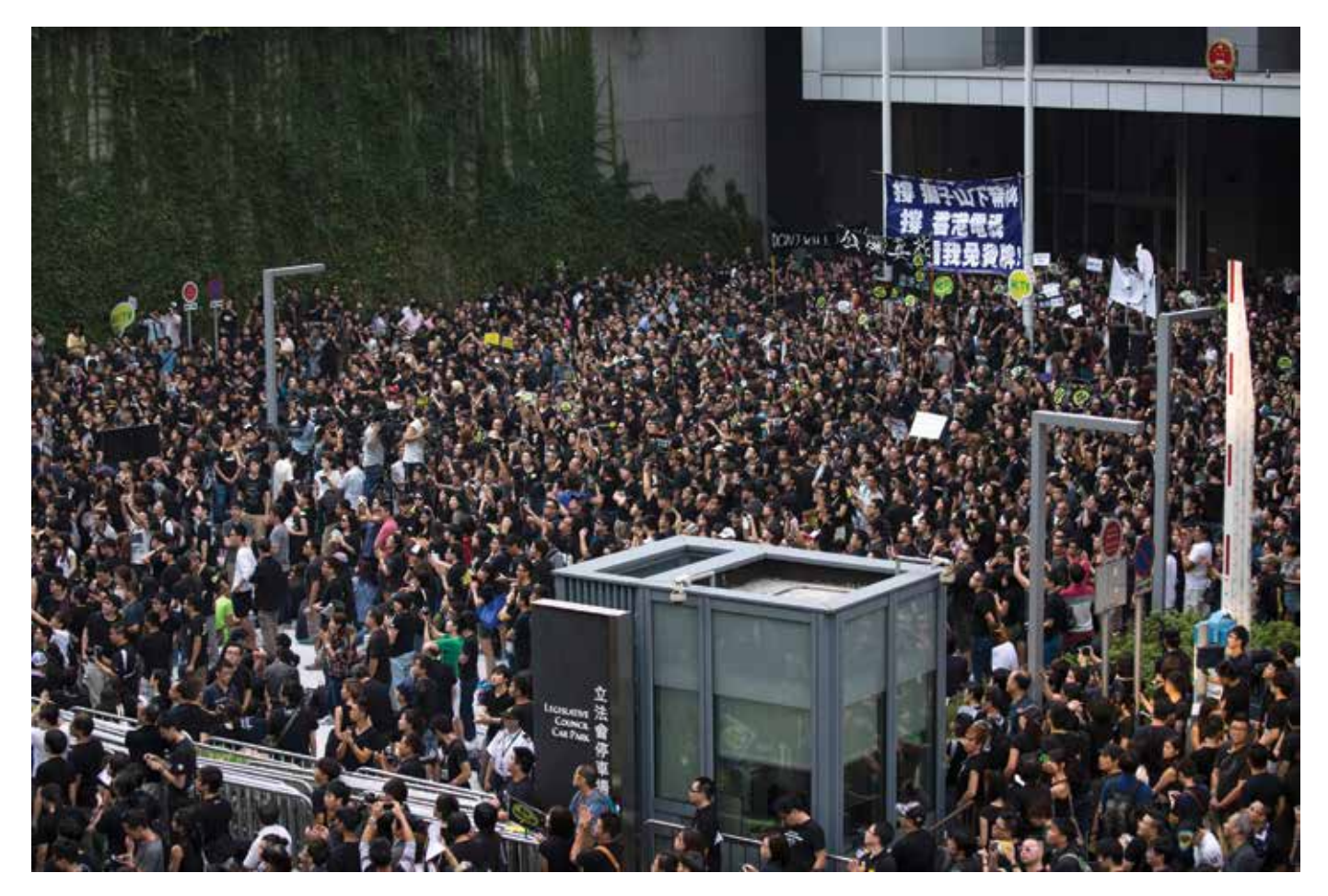
After the Hong Kong Government rejected HKTV's application for a free-to-air television license, tens of thousands of Hong Kong citizens gathered at the main Hong Kong Government Building to express their anger.

Gregory So, the Secretary for the Commerce and Economic Development Bureau, said that the issuing of licenses should "gradually progress". This phrase has been widely used by China's Central Government when dealing with universal suffrage for Hong Kong. When So was pressed by the media in following days, he began to say the decision had been made considering several