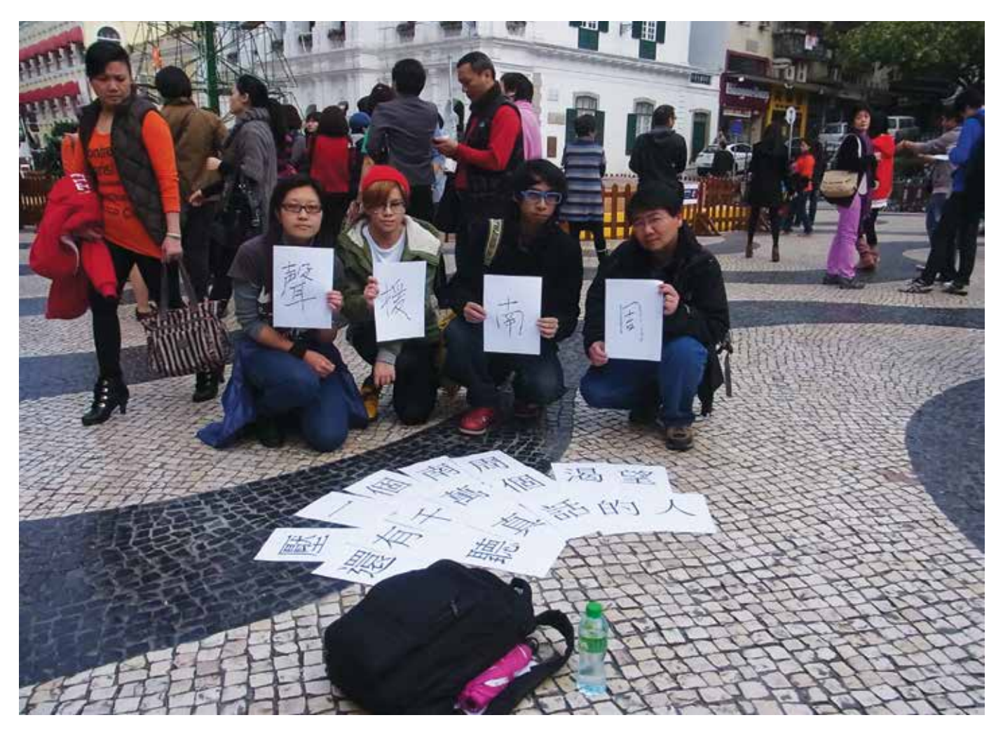
The Southern Weekly incident caused international concern. Many journalists, including a Macau reporter, and ordinary citizens, found ways to express their support for the mainland journalists.

yuan (around US$200) a month, but the basic salary of each journalist is around 400 yuan (around US$50), which does not provide a sustainable livelihood. The strike ended when management promised to increase salaries, without specifying the size of the increase. The IFJ is concerned because the media industry is highly competitive. While the Chinese government encourages acquisitions and consolidation in the industry, it is difficult for small scale and very local media outlets to survive. In addition, it is very easy to make excuses for journalists' practice of accepting "red envelopes", meaning money given by the business sector after journalists attend a press conference. A similar case involved journalist Chen Yongzhou, of New Express Newspaper, who confessed on television that he had accepted money to write reports.