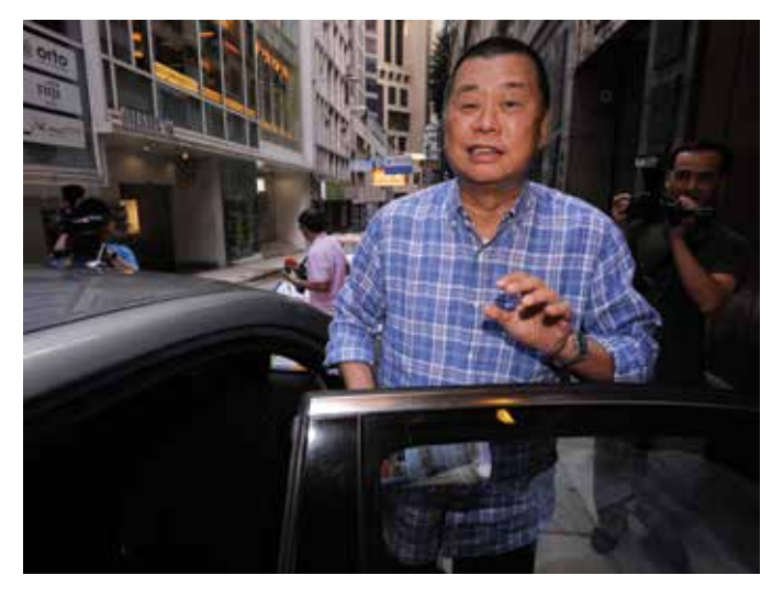
Jimmy Lai, the chairman of the Next Media Group, and other media owners received a series of threats from unidentified people in 2013, but the Hong Kong Government failed to defend press freedom by condemning the intimidation.

a former supporter of Leung ChunYing, the Chief Executive of Hong Kong, in which he disclosed how Leung had cooperated with the Hong Kong media to win the election.