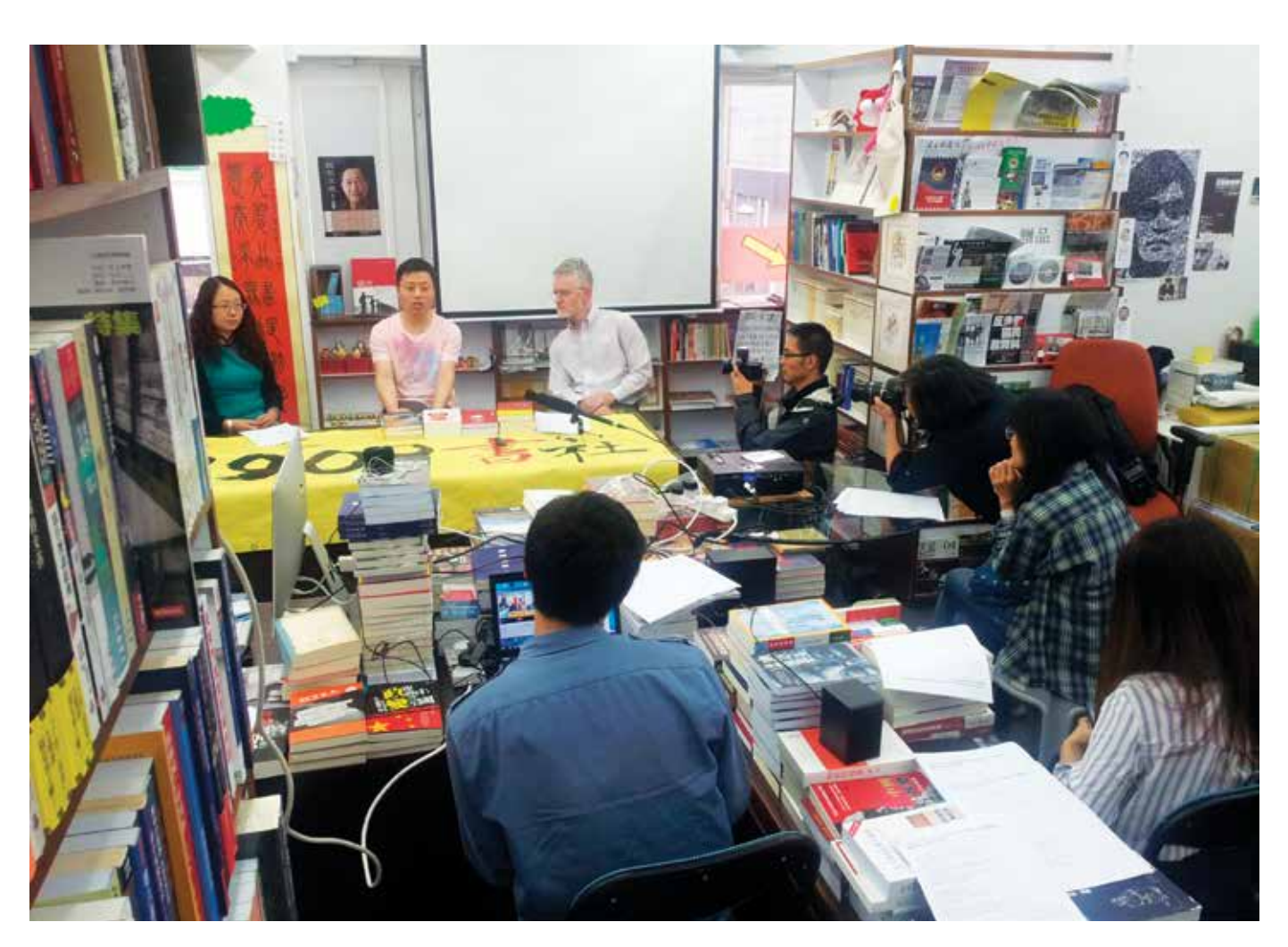
Du Bin (centre of table), a former New York Times photographer, was detained by Beijing police on an accusation of provocation and disturbing public order after he wrote a book of called Tiananmen Square Massacre.

Police accused Song of disturbing public order. Song was released on bail on August 12 after being in administrative detention for seven days.