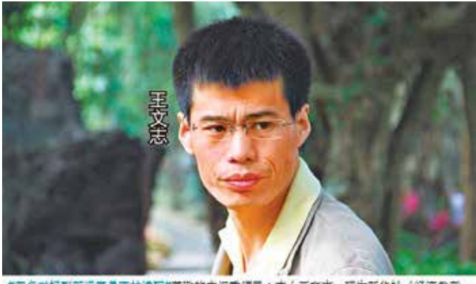
■異名単提到部級重要來林識取#導致的中經要認舉:本人至文志,或为新华社(经济參考报)曾常记者,或以公長的身份实名単报前部級官员华润真愿董事长未林等豪誉在收购山西 全业资产的百亿并购集中收意放水,致使数十亿元需说流失,来林等已构成读职,并有互额 贪褒之嫌,具体见长傲博。

The IFJ urges China to ratify the International Covenant on Civil and Political Rights, which it signed more than 15 years ago and which is enshrined in the Chinese Constitution, to ensure press freedom can be implemented. At the same time, we urge China to fully implement the International Covenant on Economic, Social and Cultural Rights, which it ratified in 2001, so that journalists can exercise their rights to receive adequate payment for their work and enjoy a reasonable standard of living, and can fight for their benefits, including by labour strikes. In addition, we urge the All Chinese Journalists Association to take up their responsibilities to fight for the rights of journalists.