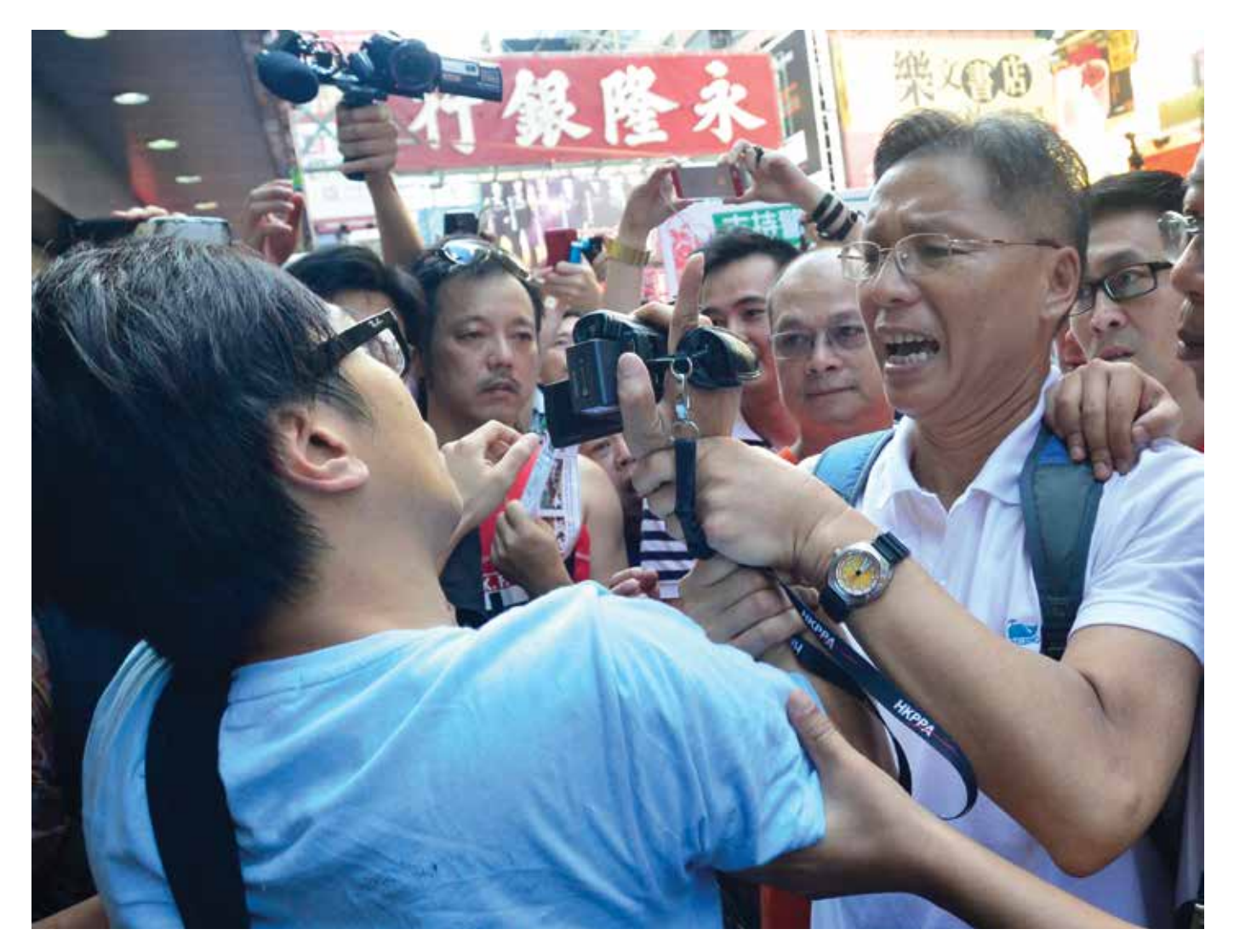
Photographers were intimidated by members of the general public with increasing frequency in 2013.

Self-censorship is still a problem for Hong Kong media. According to a poll conducted by the Public Opinion Program at the Hong Kong University in November,