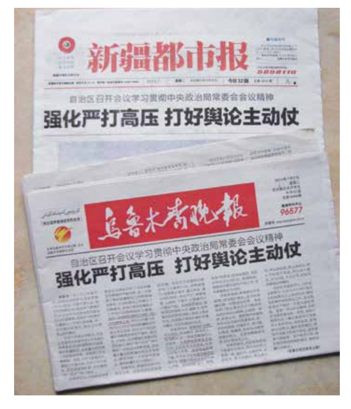
All media outlets in Xinjiang published the same content put out by the state propaganda department, thus losing credibility with society.

The first attack occurred in Lukqun township, Shanshan County, Turpan Prefecture City, where it was reported 35 people were killed. Two days later, a second attack was reported in Hanerik Township in Hotan County and Karakax County (Moyu County). According to a Global Times report, 100 Uyghurs attacked a police station after "gathering at local religious venues", leading to several casualties, but the report did not specify the cause of the attack. According to a Radio Free Asia report, the attack was provoked when a local imam was forced to keep his sermons "in line with political thinking". This led to a police raid on the local mosque, which in turn triggered a street protest by hundreds of Uyghurs. It was reported that many civilians and policemen were killed and injured. Another incident occurred in Saimachang, Tianshan District, Urumqi. According to the Global Times report, 200 people "attempted to incite trouble" but no explanation was given regarding the cause of the incident.