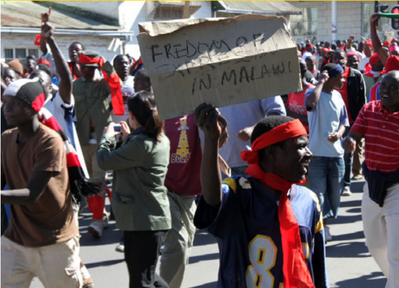
Peaceful demonstrations against President Mingu wa Mutharika and the DPP-majority government. In Blantyre, Malawi.

Malawi's score improved from 60 to 53 as the country experienced a reversal of a downward slide when new president Joyce Banda took office in April. Banda repealed a restrictive media law and fostered a climate that led to a reduction in instances of official censorship and government intimidation, harassment, and violence against journalists.