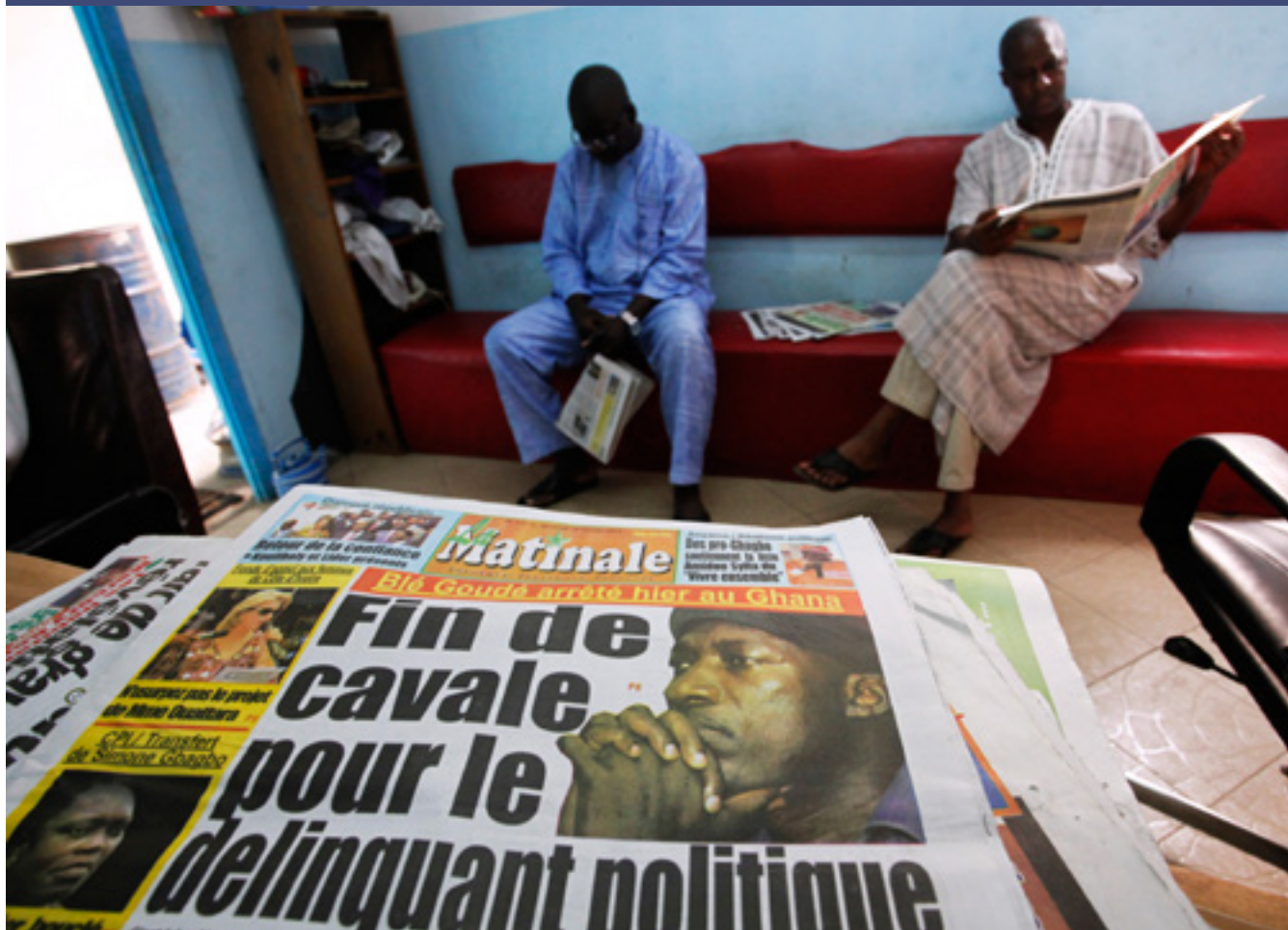
The front page of a newspaper, featuring the arrest of Ivorian political leader Charles Ble Goudé, is seen in Abidjan on January 18, 2013.

Côte d'Ivoire's score improved from 70 to 61 due to the generally less restrictive legal and political environment for the press under the new government of Alassane Ouattara, including a decrease in harassment and attacks on foreign and local journalists, more space for critical reporting, and the opening up of radio and television airwaves to private broadcasters.