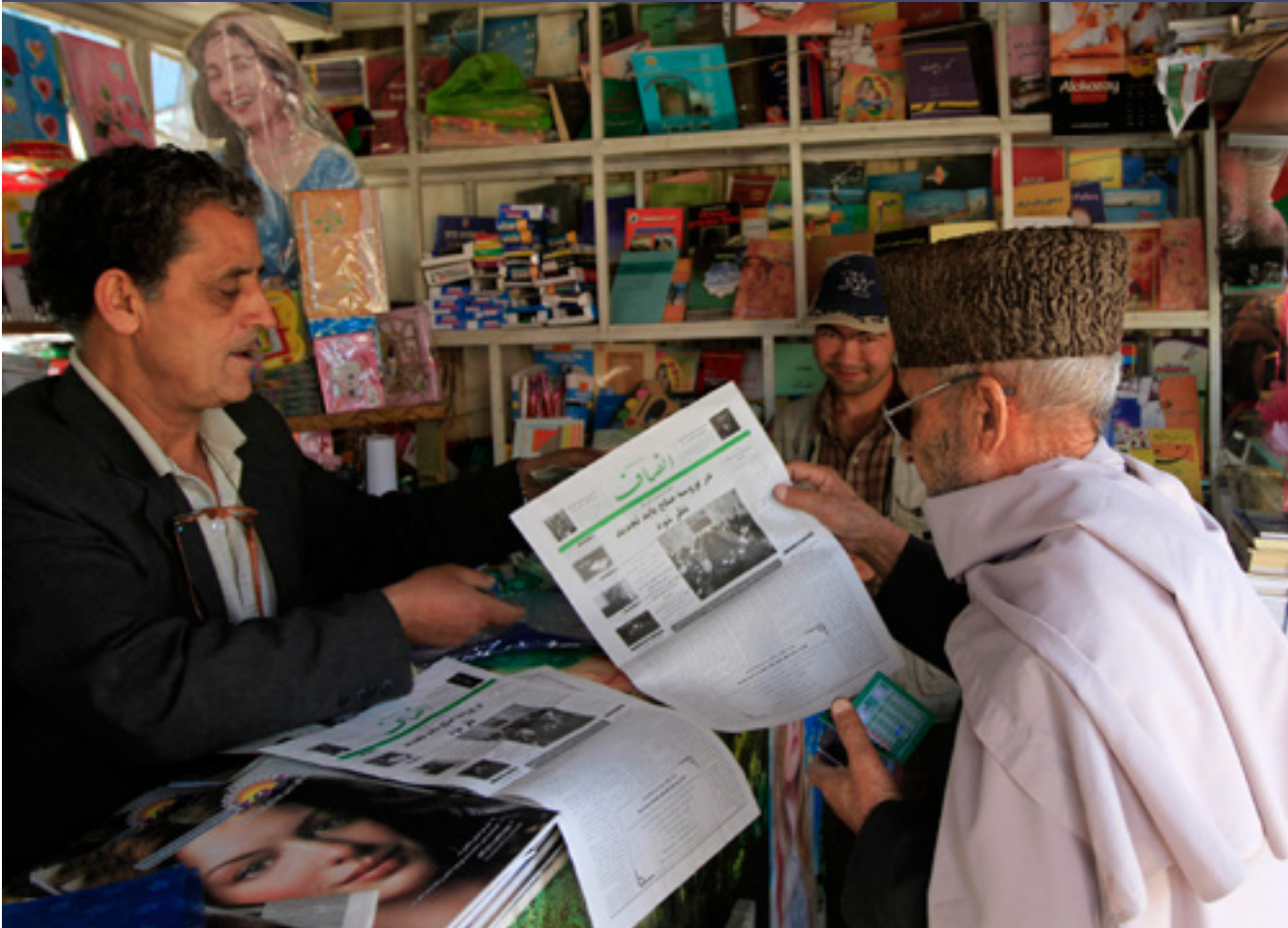
A man buys Ensaf newspaper at a kiosk in Kabul on May 22, 2012.

In Afghanistan a continuing decrease in violence against journalists, the opening of a number of new private media outlets that are free to criticize the government, and a decline in official censorship and prosecutions of journalists caused the score to improve from 74 to 67.