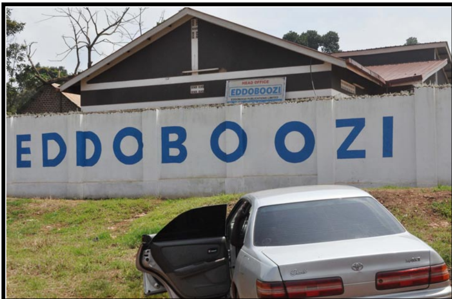
Eddoboozi newspaper offices along Masaka Road raided in Septmeber by unknown people. Police promised to investigate the matter.